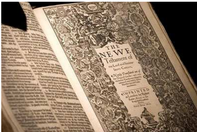
The 1611 KJB New Testament Title Page 1